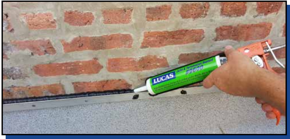
JOINT AND TERMINATION

Lucas #9600 non-shrinking formula has outstanding adhesion properties to metal, concrete, masonry, wood, EPDM, PVC, vinyl surfaces, silicone surfaces and most other common building materials. Available in 7 colors.