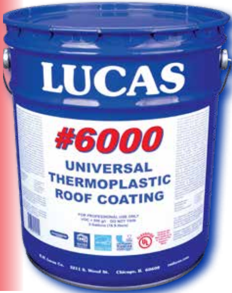
Not available in California